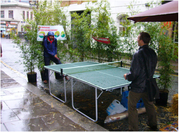
Rain or shine, PARK(ing) Day brings creativity to city streets.

While participating individuals and organizations operate independently, they do follow a set of established guidelines. Newcomers can pick up the PARK(ing) Day Manifesto , which covers the basic principles and includes a how-to implementation guide.