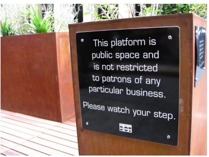
New York City now sanctions what used to be done by advocates.