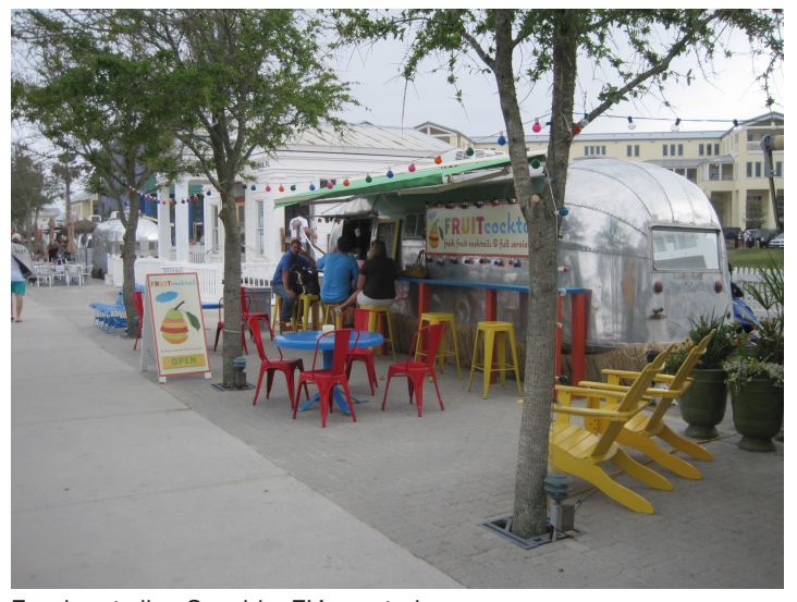
Food carts line Seaside, FL's central square.