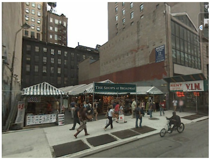
Pop-up tent-based retail helps activate this vacant lot.

More than just marketing ploys for large retail corporations, pop-up stores genuinely bring vitality and help businesses transition to permanent spaces.