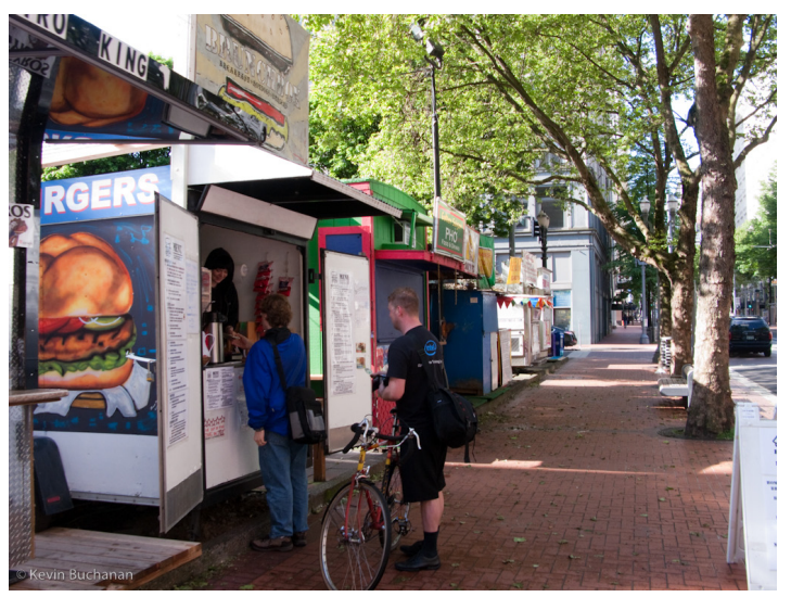
Food carts in Portland, OR

From Los Angeles to Miami, smart cities not only lower the barriers to entry, but also nurture such businesses, as they they contribute to the city's local economy and enhance its sense of place.