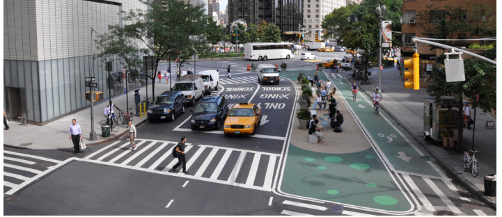
NYC's Greenlight for Broadway provides more space for people.