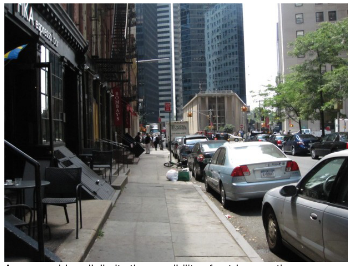
A narrow sidewalk limits the possibility of outdoor seating.

In city's with a short supply of space and a need for more publicly accessible seating, pop-up café's are fast becoming a valued addition to the public realm. If successful, they can also prove the need for permanently expanding city sidewalks.