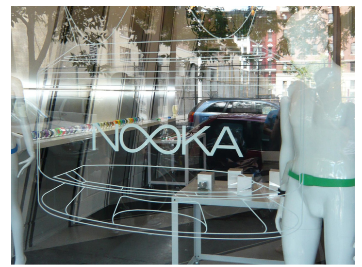
A Pop-Up Shop