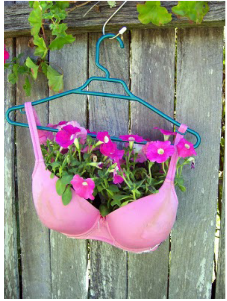
Guerilla Gardening offers an outlet for creative energy.

Guerilla gardening is an exellent tactic for instantly improve an urban neighborhood. Often times, gardens are cared for years after they are first created, illegally. Indeed, the first garden started in a vacant New York City lot by the Green Guerilla's became so loved that it is now maintained by volunteers and the New York City Parks Department. This exemplifieshow tactical urbanism is intended to work.