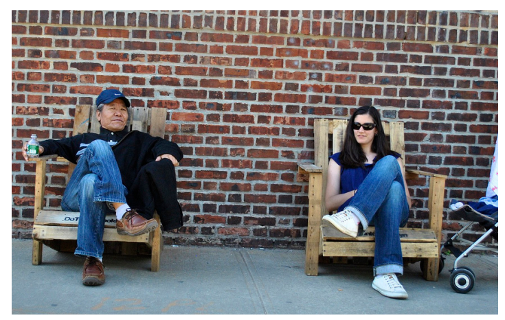
Step 3: Place chairs where needed.