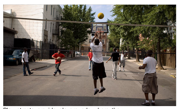
Play streets provide playgrounds where they don't currently exist.