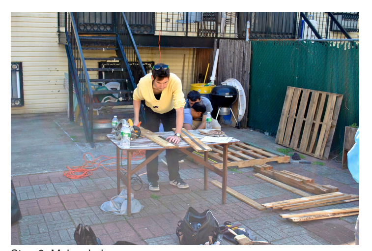
Step 2: Make chairs.