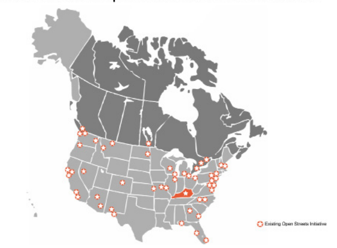
North America's Open Streets Initiatives.