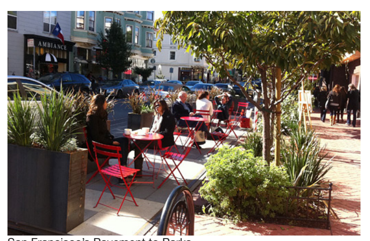
San Francisco's Pavement to Parks.