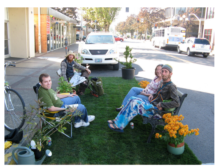
A simple PARK(ing) Day installation.