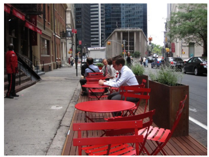
Trading parking space for outdoor seating that can be used by restaurant patrons or passersby is a win-win.