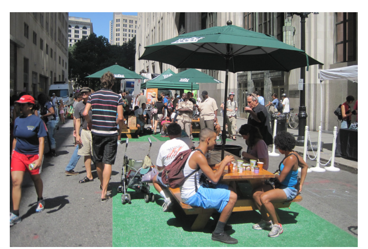
Street fairs help bring communities together in the public realm.