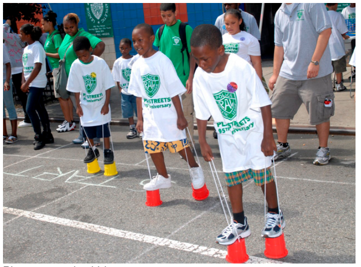
Play streets give kids space to move.

In New York City, a 'play street' is made possible when 51% of the residents living on a one-way residential block sign a petition and offer it to their local police and transportation officials, who then send it to the local community board for review. Once the community board approves the idea, the initiative can take shape and the city provides youth workers to supervise the program. Approximately 75% of these initiatives are organized by the New York City Police Athletic League.