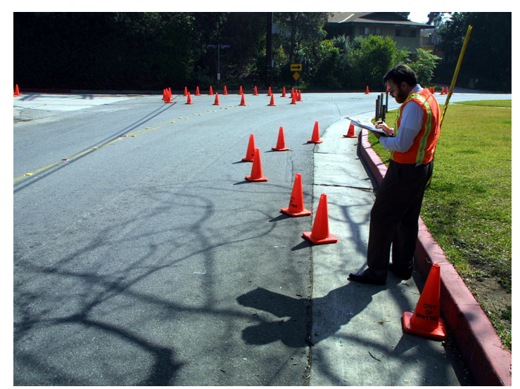
Temporary experiments can test physical improvements prior to implementation.

If included as part of a public charrette process, some examples of tactical urbanism may more quickly build trust amongst disparate interest groups and community leaders. Indeed, if the public is able to physically participate in the improvement of the city, no matter how small the effort, there is an increased likelihood of gaining public support for larger scale change later. Additionally, involving the public in the physical testing of ideas can yield unique insights into the expectations of future users and the types of design features for which they yearn; truly participatory planning must go beyond drawing on flip charts and maps.