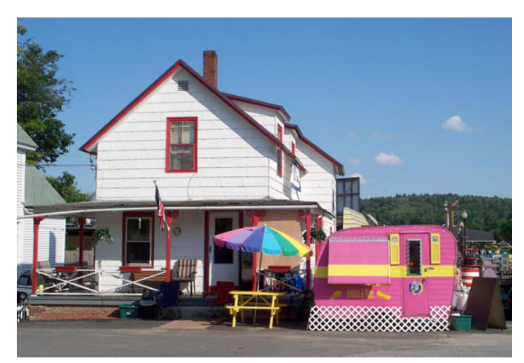
Food carts offer low start-up costs for any entrepreuner.