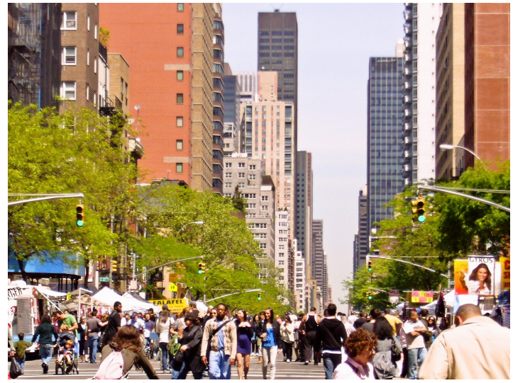
One of New York City's many street fairs.

Steet Fairs are the type of event where people become familiar with each others skills and learn what their community has to offer. Often, street fairs take place within a community's main street, or at larger sites, such as the village green or a centrally located plaza. This can raise the visibility of the city's premier public space and offer entertainment to citizens of all ages: many well-programmed street fairs feature musical performances, art exhibitions, interactive entertainment, and local food vendors. Street fairs can also provide the opportunity for communities to organize political support for local improvement initiatives.