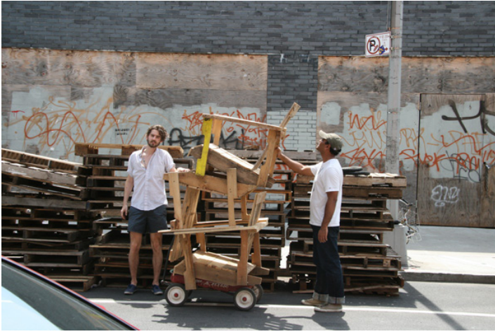
Step 1: Collect used shipping pallets.

Whether to rest, socialize, or to simply watch the world go by, increasing the supply of seating almost always makes a street, and by extension, a neighborhood, more livable.