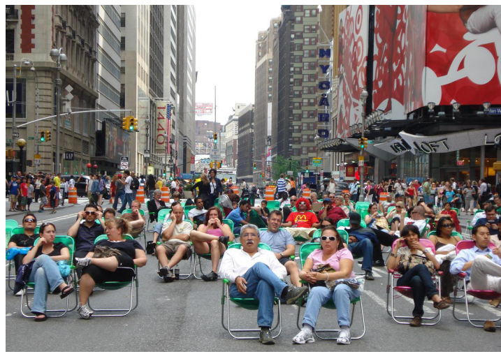
Phase 1 of the new Times Square simply added lawnchairs.

By taking this experimental, "lighter, quicker, cheaper," approach, the City and public-at-large are able to test the performance of each new plaza without using up scarce public resources. If successful, the intervention can then transition into a more permanent design and construction phase, as is happening currently in several of New York City's new plazas and sustainable street "pilot" projects.