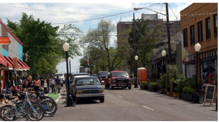
Before and after: Dallas Build a Better Block