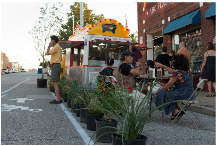
Fort Worth, TX Build a Better Block.

country. Indeed, similar efforts have now taken place in Forth Worth, TX, Oyster Bay, NY, Oklahoma City, OK, and Memphis, TN where 15,000 participants helped reinvigorate a stretch of Broad Avenue.