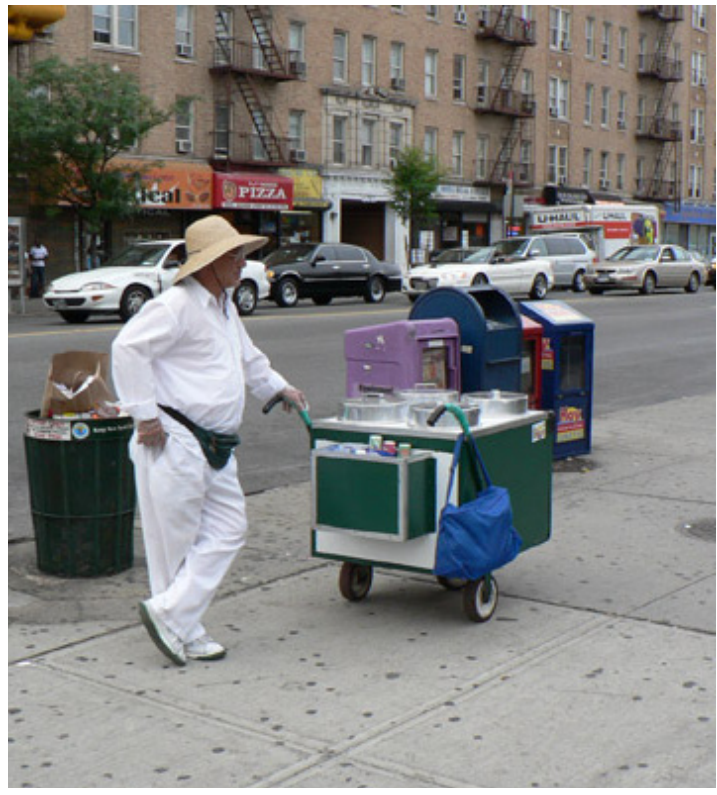
A New York City Street Vendor

According to Shinohara, vendors play a key role in animating the various spaces of a city. This "Custom Bike Urbanism [...]" suggests a possibility of constructing urban spaces that are individualistic and dispersed, yet able to accommodate a multitude of dynamic forms. With the inherent characteristics of mobility and ephemerality, it brings vibrancy to redundant urban space and enhances the function of the existing city."