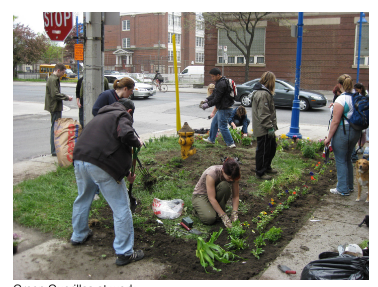
Green Guerillas at work.