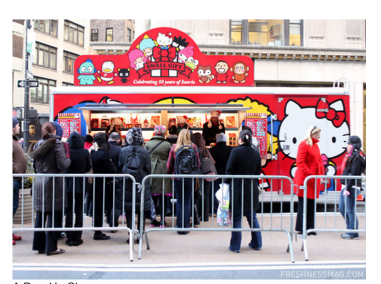
A Pop-Up Shop