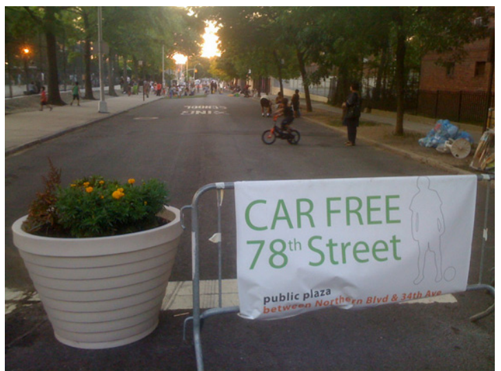
Car free space provides carefree play space.